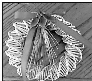
Wheat Weaving Wreath Pg 40