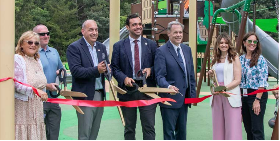
Eno's Pond County Park Playground Ribbon Cutting Ceremony