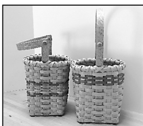
Single Wine Basket Pg 43