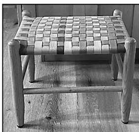
Nesting Footstools Pg 43