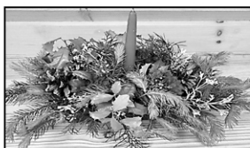
Holiday Centerpiece Pg 43