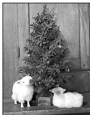
Wooly Pine Tree Pg 39