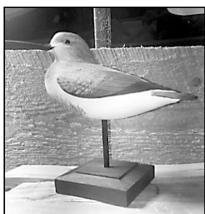
Shorebird Decoy Dunlin Pg 40