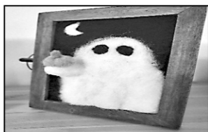
2D Felting Ghost Pg 38