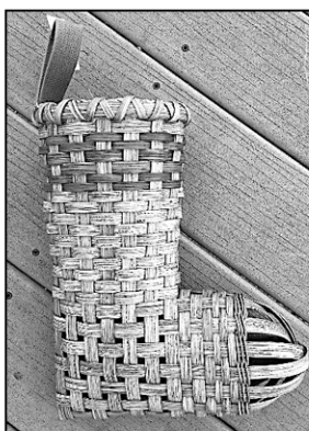
Christmas Stocking Basket Pg 43