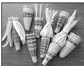
Indian Corn Pg 43