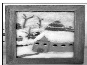
2D Felting Winter Scene Pg 42